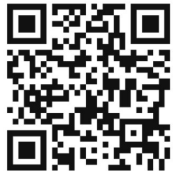
Scan QR code to visit our website.

Introducing our handcrafted vodka made from the finest Essex farm potatoes. Distilled twice in copper stills to deliver a deliciously smooth and refreshing vodka with a hint of vanilla. Best served slightly chilled.